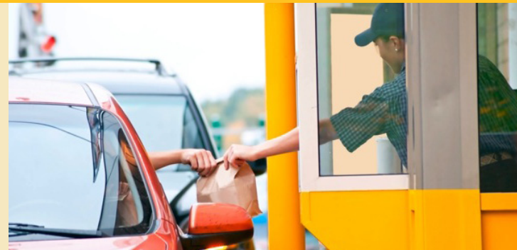
Figure 1. Americans love their drive-throughs, but are they more fuel-efficient and environmentally friendly than parking and going into the restaurant?

The bulk of idling research to date has focused on the effects of heavy- and medium-duty diesel vehicle idling. But most research has ignored passenger car idling—even at schools—as a source of emissions and wasted fuel.