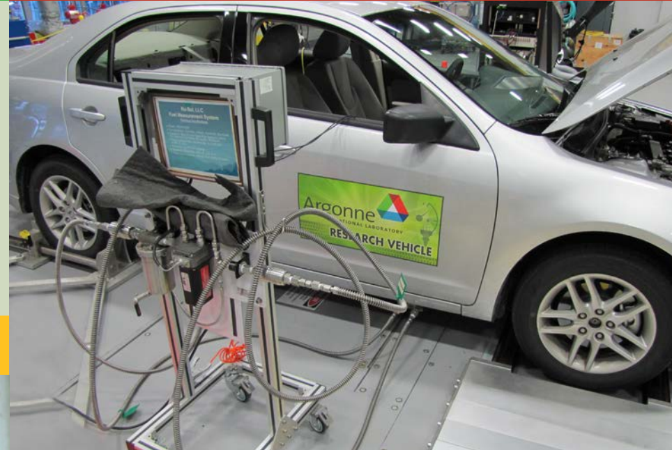
Figure 2. Ford Fusion Test Vehicle

Argonne National Laboratory used a 2011 Ford Fusion mid-sized sedan with a 2.5-L, 4-cylinder engine (175 HP) and 6-speed automatic transmission (Figure 2). Its EPA fuel-efficiency label shows 23 mpg city/33 mpg highway and 26 mpg combined. We equipped the vehicle to measure numerous engine parameters and temperatures, including catalyst inlet and brick temperatures and oil and coolant temperatures. We collected data in one of Argonne's test cells at the Advanced Powertrain Research Facility (APRF), using a SemtechD emissions analyzer for emissions and a direct fuel flow meter for fuel measurement. The vehicle was prepared and run by using approximate Federal Test Procedure (FTP) standard ambient temperature testing criteria. The emissions of interest in this study include total hydrocarbons (THC), nitrogen oxides (NO x ), carbon monoxide (CO), and carbon dioxide (CO 2 ).