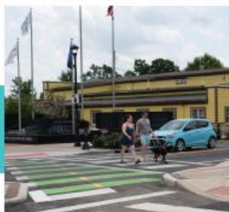
High Visibility Crosswalk