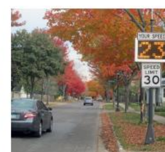
Speed Feedback Sign