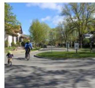
Mini Traffic Circle