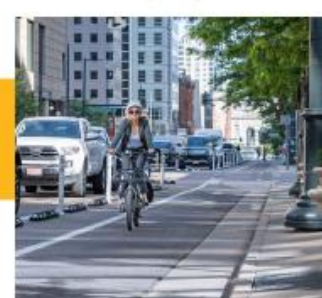
Separated Bike Lane (SBL)