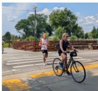
Midblock Trail Crossing