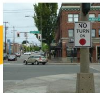
No Turn On Red