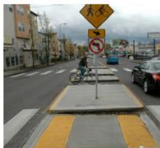
Median Refuge Island