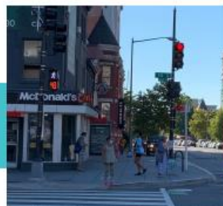
Leading Pedestrian Intervals (LPIs)