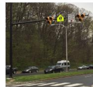
Pedestrian Hybrid Beacon (PHB)