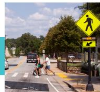
Rectangular Rapid Flashing Beacon (RRFB)