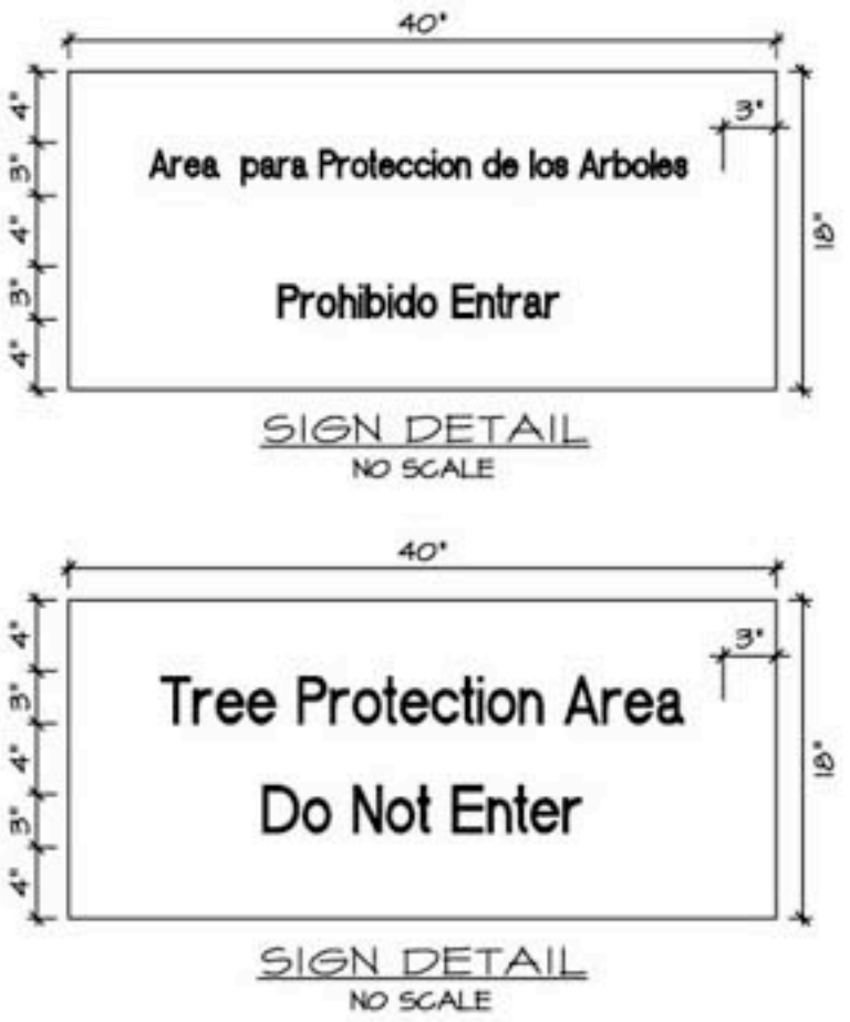
TREE PROTECTION FENCE SIGN DETAIL NO SCALE

NOTES: 1. WARNING SIGNS SHALL BE MADE OF DURABLE WEATHERPROOF MATERIAL. 2. LETTERS SHALL BE 3" HIGH MINIMUM, CLEARLY LEGIBLE, AND SPACED AS SHOWN. 3. SIGNS ARE TO BE PLACED NO GREATER THAN 75 FT. ON CENTER. 4. PLACE SIGN AT EACH END OF LINEAR TREE PROTECTION AREAS AND 75 FT. ON-CENTER THEREAFTER. 5. FOR TREE PROTECTION AREAS LESS THAN 75 FT. IN PERIMETER, PROVIDE NO LESS THAN ONE SIGN PER AREA. 6. ATTACH SIGNS SECURELY TO FENCE POSTS AND FABRIC. 7. MAINTAIN TREE PROTECTION FENCE THROUGHOUT DURATION OF PROJECT. 8. ADDITIONAL SIGNS MAY BE REQUIRED BASED ON ACTUAL FIELD CONDITIONS.