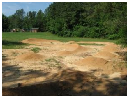
Durham Solite Park Pump Track