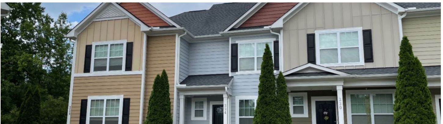
▲ Ballentine Neighborhood in the Lake Hogan Farms area developed by Community Home Trust

A Identify funding to expand weatherization efforts already happening through the Orange County Home Preservation Coalition. Work with other Orange County governments to fund staffing for that program and augment WAP funds so that the Community Action Agency can increase their annual quota for Orange County's and Carrboro's low-income household weatherization work.