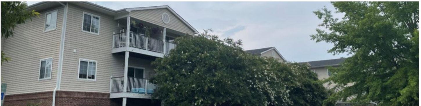
▲ Carolina Spring Senior Apartments is a 124-unit Low-Income Housing Tax Credit (LIHTC) project

C Encourage market-rate developers to team with affordable housing developers. Increase the production of affordable housing by encouraging development teams to meet multiple Town goals for affordable housing, economic sustainability, and opportunities for BIPOC and local developers.