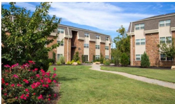
▲ EMPOWERment, Inc. is a long-time provider of affordable housing in Carrboro and Chapel Hill. Collins Crossings provides 1- and 2-bedroom units near a grocery store and other amenities.

A Work with Orange County to support programs that expand use of vouchers and landlord acceptance of housing vouchers. Participate in the County's efforts to educate landlords on the benefits of accepting vouchers and non-discrimination based on source of income. Refer residents to the County to coordinate ongoing services to voucher-holders to assist them in workforce training, career development, accessing day care, elder care, health care, etc. so that they can build household earnings and therefore more stable housing over time.