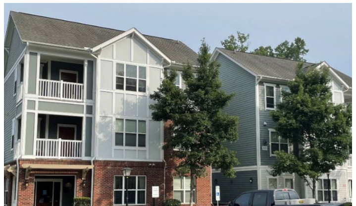
▲ The Landings at Winmore is a 58-unit Community Home Trust affordable rental development in Carrboro

A Expand the reach of cooperative housing models, Community Home Trust, Habitat for Humanity of Orange County, to reach more households and at different income thresholds. Work with partners to expand the cooperative housing and land trust models to offer a broader array of tools to preserve affordable housing and market the programs to renters and low- to moderate-income households interested in purchasing homes.