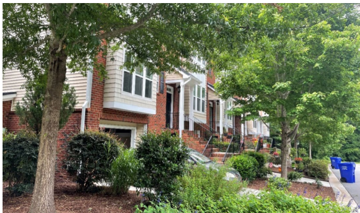
▲ Attached housing in the Rose Walk neighborhood

A Seek funding and resources to expand the capacity of organizations that provide homeownership counseling services for new buyers, income-eligible existing homeowners, and prospective homebuyers to expand the pool of eligible applicants and reduce the likelihood of foreclosure.