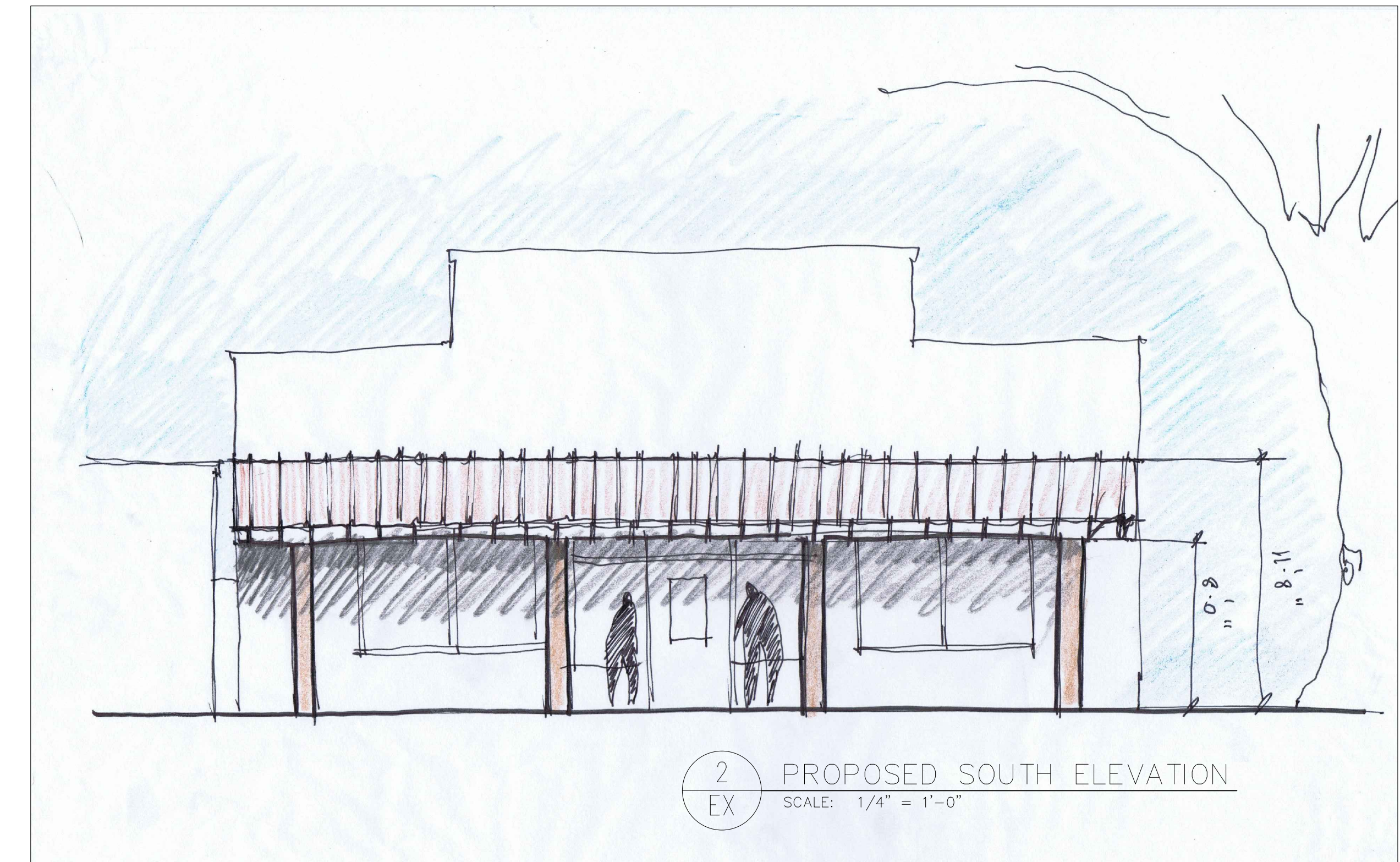
2 EX PROPOSED SOUTH ELEVATION SCALE: 1/4" = 1'-0"