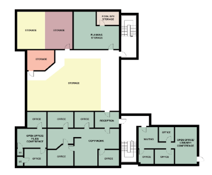
Second Floor Plan || 6,218 GSF / 5,332 NSF