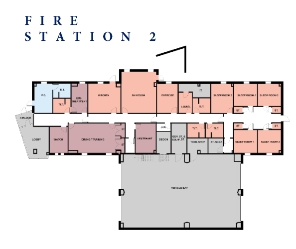
First Floor Plan | 8,257 GSF / 7,008 NSF