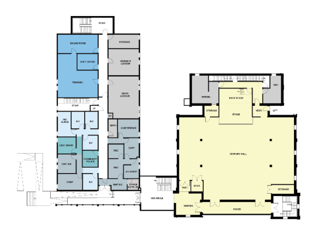
Second Floor Plan || 11,110 GSF / 9,496 NSF