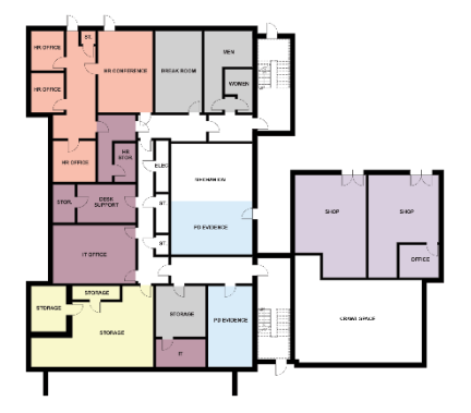
Basement Floor Plan | | 6,892 GSF / 5,088 NSF