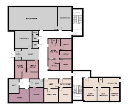
First Floor Plan || 6,218 GSF / 5,054 NSF