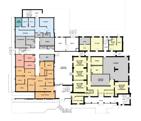
First Floor Plan | 12,266 GSF / 8,938 NSF