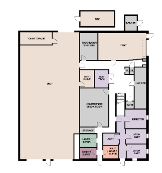
First Floor Plan 6,004 GSF / 5,183 NSF