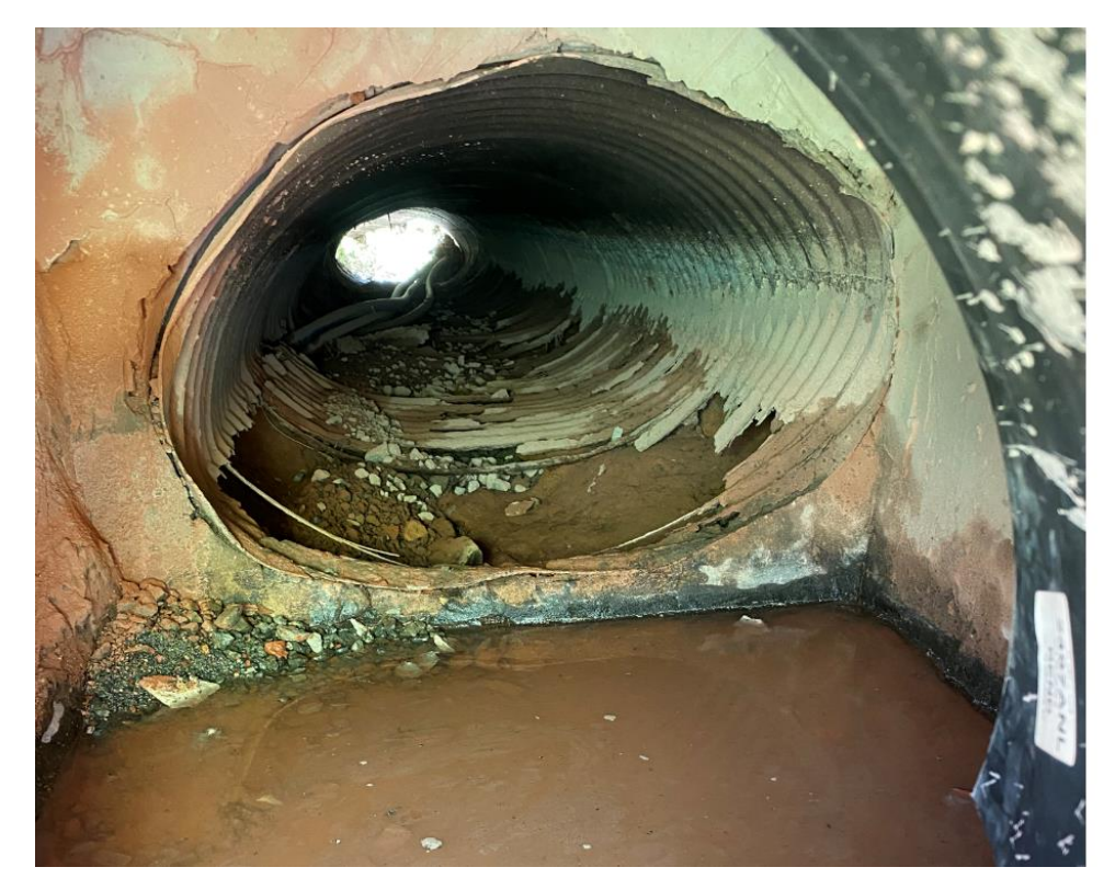
Exhibit 1: Existing Carr St. Culvert (Previous design included reusing this infrastructure)

Exhibit 2: Proposed new Carr St. Culvert Replacement Design