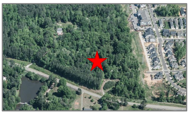
Figure 1. Image from Bing's Bird's Eye View of site.

The Town has received a petition from Adam and Omar Zinn, owners of Parker Lewis, LLC to rezone three contiguous parcels of land, along the north side of Homestead Road, from R-20 to R-3, Conditional, for the purpose of developing an Architecturally Integrated Subdivision (AIS) consisting of a combination of single family and multi-family units. The Town Council has set a public hearing date of June 6, 2023. Should the Town Council approve the rezoning, the applicants would follow with an application for a special use permit-A. The special use permit