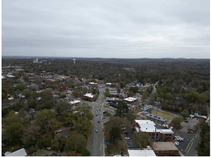
Downtown Carrboro 11/2022

For more information see the Reference page.