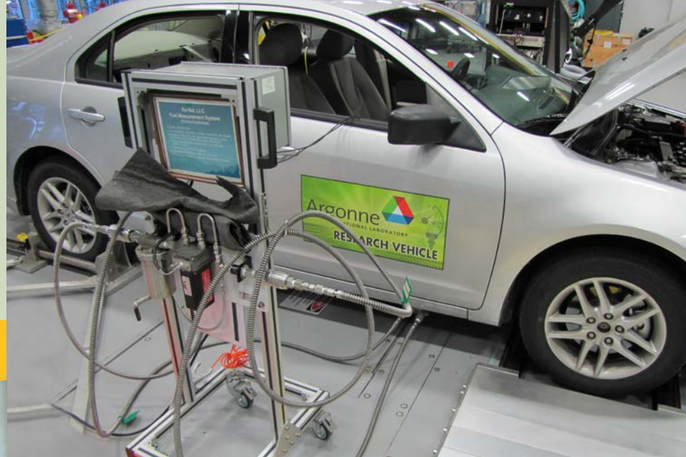
Figure 2. Ford Fusion Test Vehicle

Argonne National Laboratory used a 2011 Ford Fusion mid-sized sedan with a 2.5-L, 4-cylinder engine (175 HP) and 6-speed automatic transmission (Figure 2). Its EPA fuel-efficiency label shows 23 mpg city/33 mpg highway and 26 mpg combined. We equipped the vehicle to measure numerous engine parameters and temperatures, including catalyst inlet and brick temperatures and oil and coolant temperatures. We collected data in one of Argonne's test cells at the Advanced Powertrain Research Facility (APRF), using a SemtechD emissions analyzer for emissions and a direct fuel flow meter for fuel measurement. The vehicle was prepared and run by using approximate Federal Test Procedure (FTP) standard ambient temperature testing criteria. The emissions of interest in this study include total hydrocarbons (THC), nitrogen oxides (NO x ), carbon monoxide (CO), and carbon dioxide (CO 2 ).