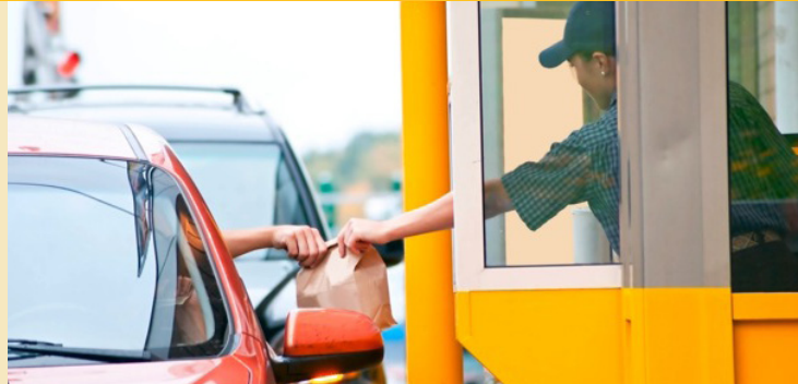
Figure 1. Americans love their drive-throughs, but are they more fuel-efficient and environmentally friendly than parking and going into the restaurant?

The U.S. Department of Energy Clean Cities Program uses its national network of almost 100 local coalitions to reduce transportation dependence on petroleum through the use of alternative fuels and efficiency measures, including idling reduction. The program therefore funded Argonne to measure idling fuel use by and emissions from light-duty vehicles and to compare these to start-up emissions to enable data-based decision making.