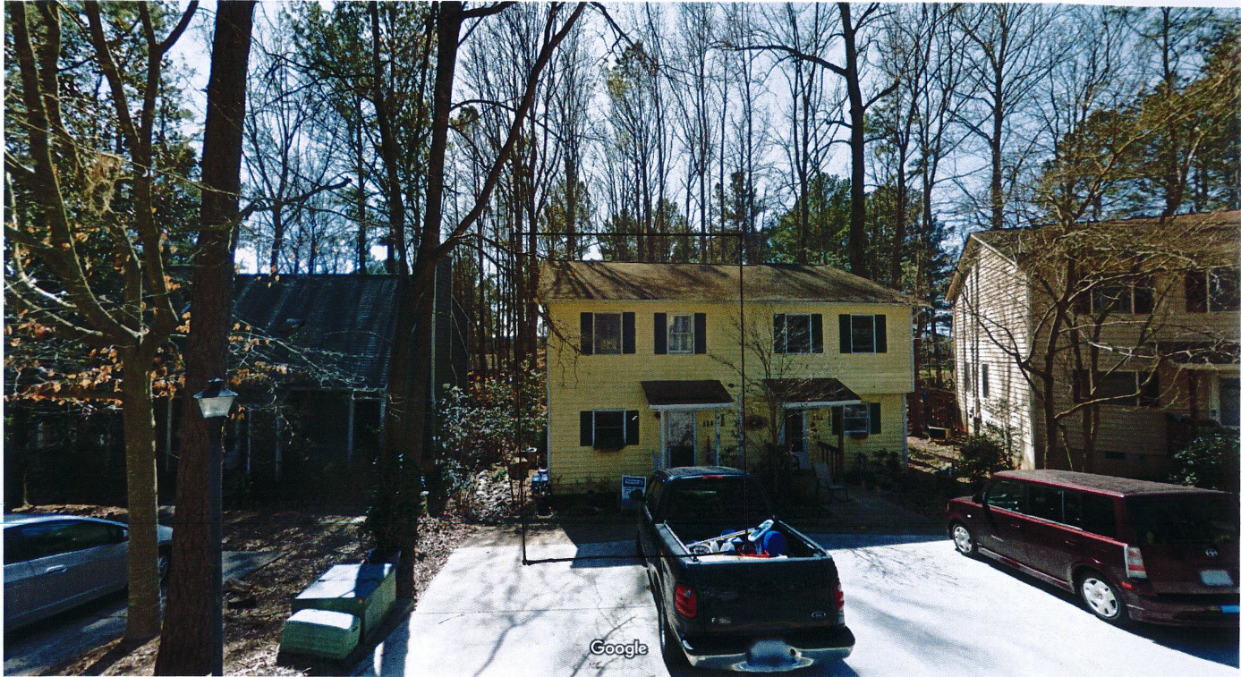
Camboro, North Carolina Street View - Mar 2016