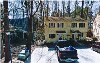
114 Lantern Way Carrboro, NC 27510

Imagery ©2016 Google, Map data ©2016 Google 100 ft