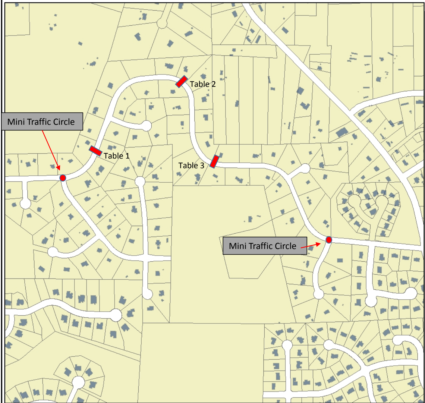
Tallyho Trail Stage 2 Traffic Calming - March 2017

Install 'walk on left facing traffic' signs in appropriate places along the road