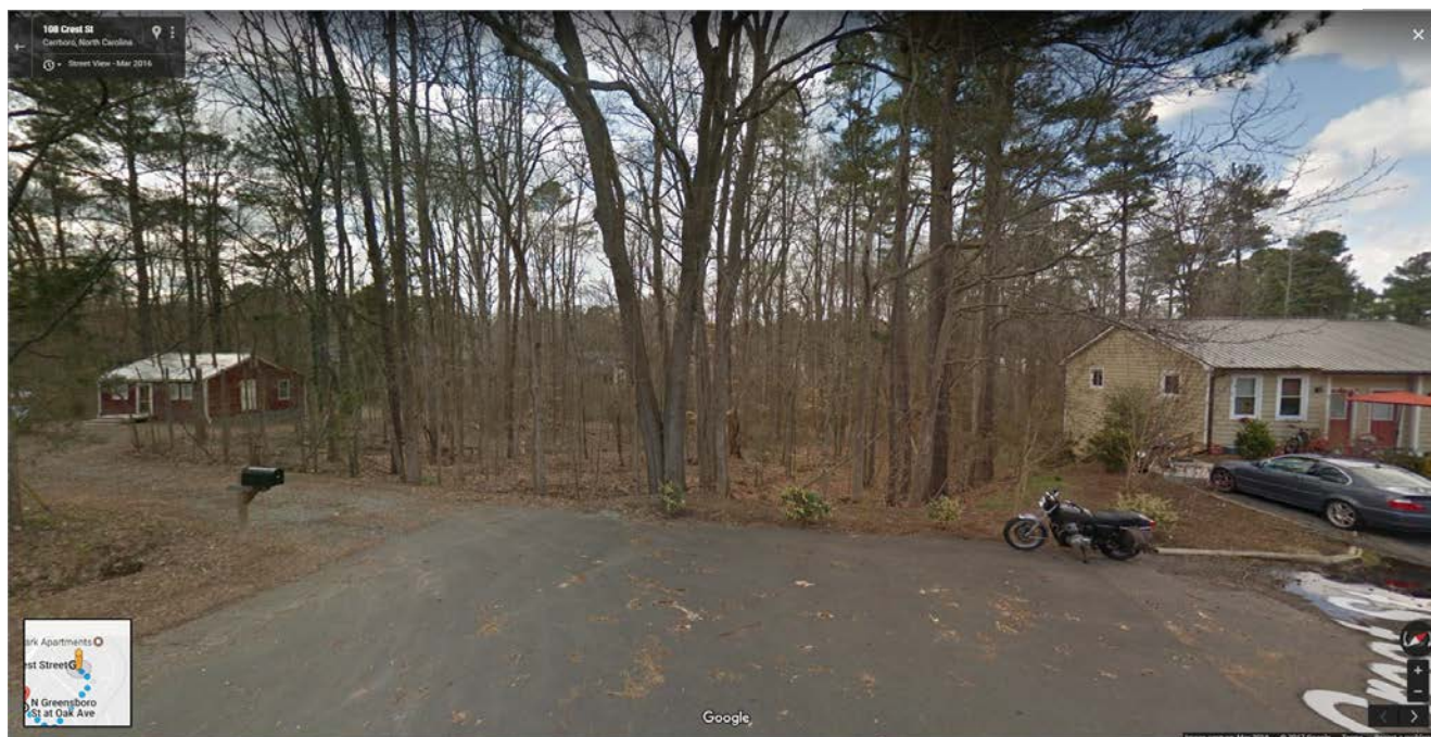
View of site from Crest Street