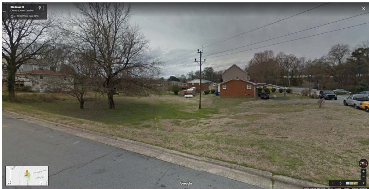
View from near the corner of Lloyd St and Hill St