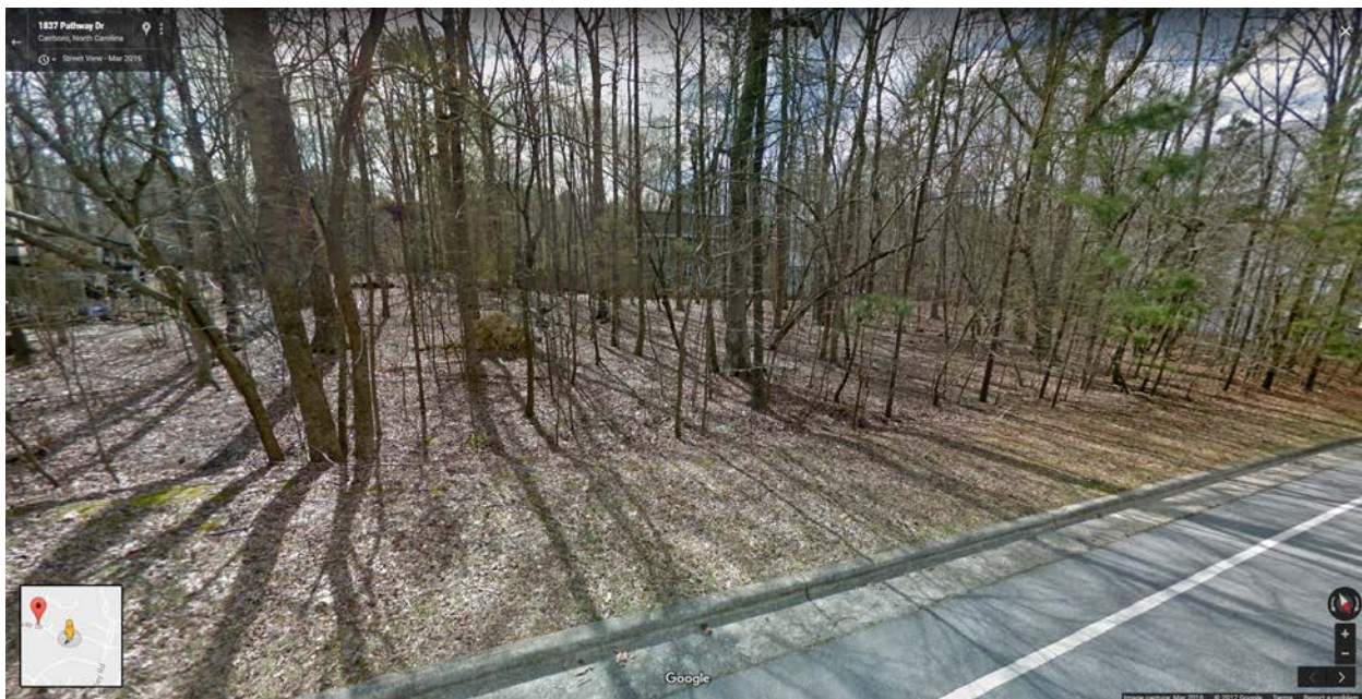
Street view of the portion of the site that crosses over the street