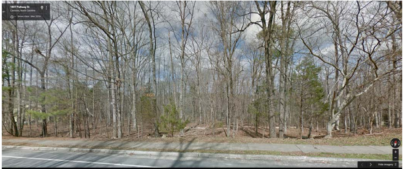
Street view near the center of the properties along the street