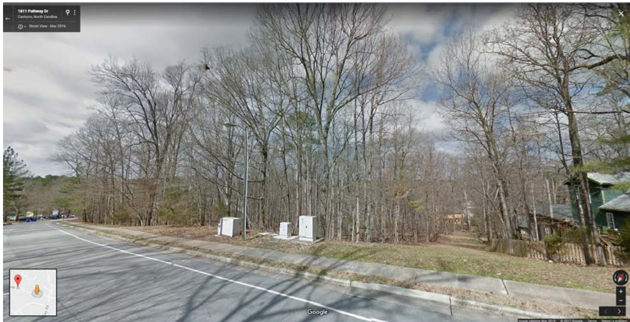
Street view from the eastern portion of the properties along the street