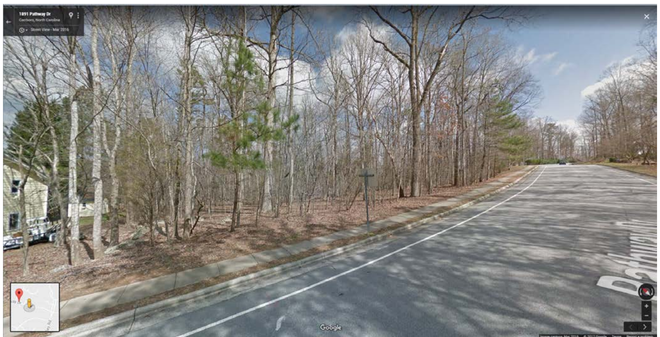
Street view on the western portion of the properties along the street