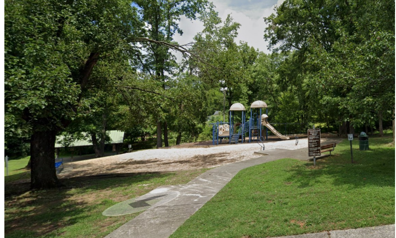
8. Henry W. Baldwin Park – possible freestanding sign/mural location