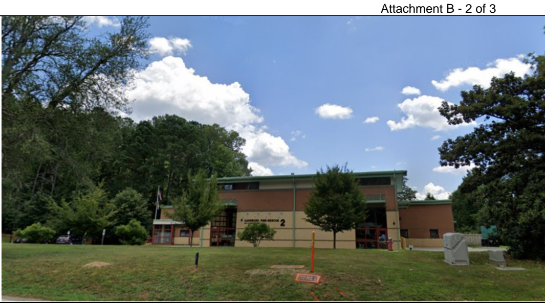
6. Fire station # 2. Attaching panels to lighter colored areas on front of station.