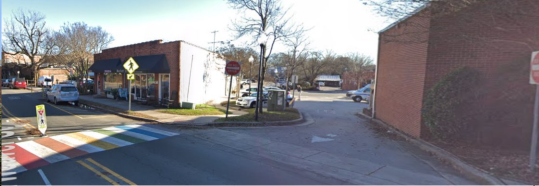
4. Century Center. Part of east facade of Century Center. Possible also partner with owner of former Market Street coffee space (building on left).