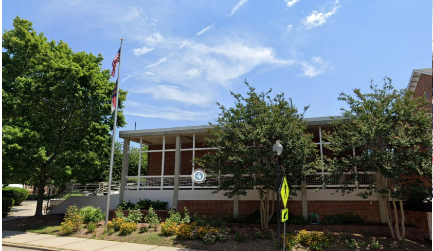
3.Century Center. Side of ramp/entrance porch.

2.Century Center. West façade- near clock tower has been proposed (Quinton Harper email, 8/31/2020).