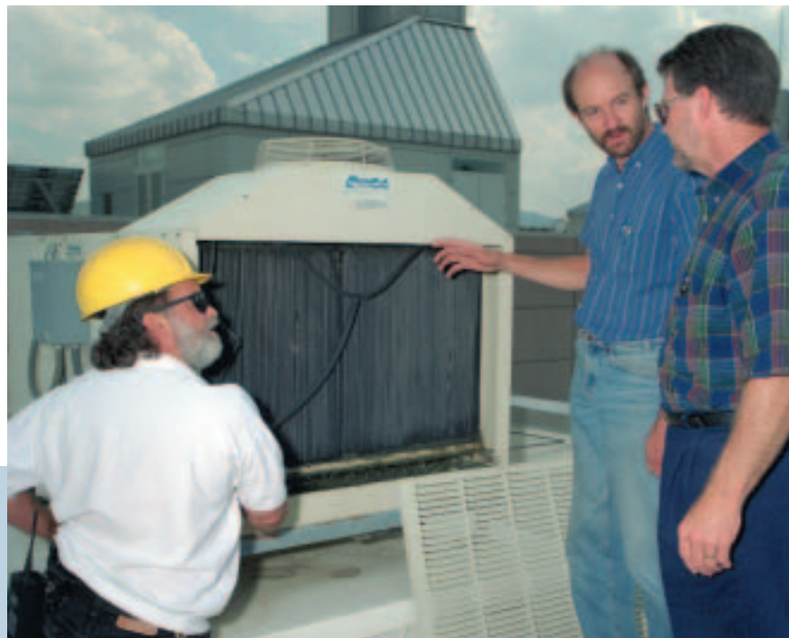
Rooftop cooling equipment inspection with building owner representative, facility engineer, and installer.

Commissioning can also evaluate claims about the construction materials such as durability and VOC emission content. It can improve power quality for the overall building by verifying that electrical building support and