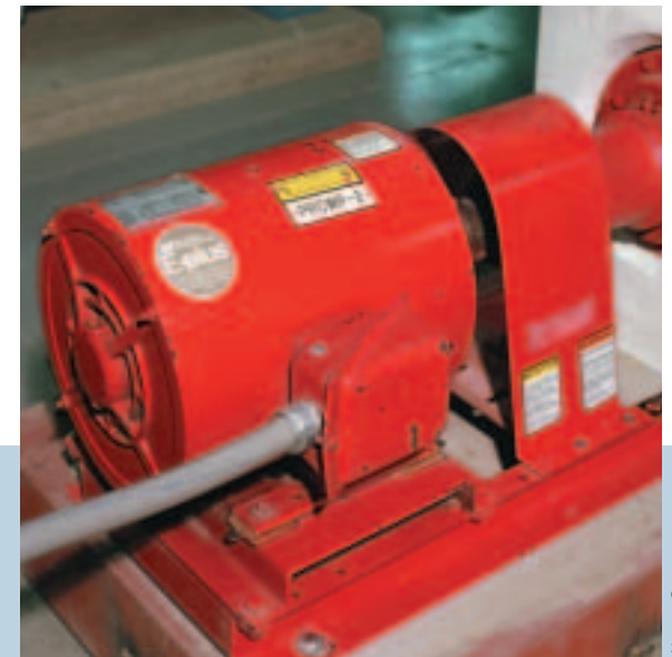
Perform functional tests at design, intermediate, and minimum flow conditions on variable frequency drive motors controlling variable flow hydronic systems.

– Building Commissioning: The Key to Quality Assurance, U.S. Department of Energy