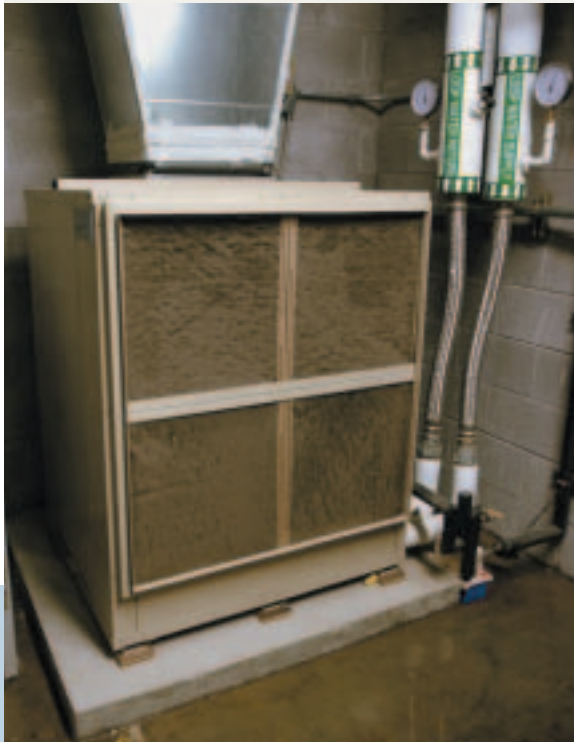
Craig Miller, DOE

Consider a building flush-out period after construction completion and prior to occupancy to reduce possible indoor air quality contamination. This involves running the mechanical system with tempered 100% outside air for an extended period of time (two weeks). Flushing out the building may be particularly important when high VOC- and particle-emitting construction materials, furnishings, interior finishes, and cleaning agents have been applied. Change all ventilation air filters as a final step of building flush-out.